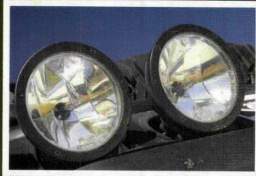
Hella spotlights: four high-power Xenon spots are mounted on the roof rack, complementing the standard Disco 4 lights to provide exceptional illumination