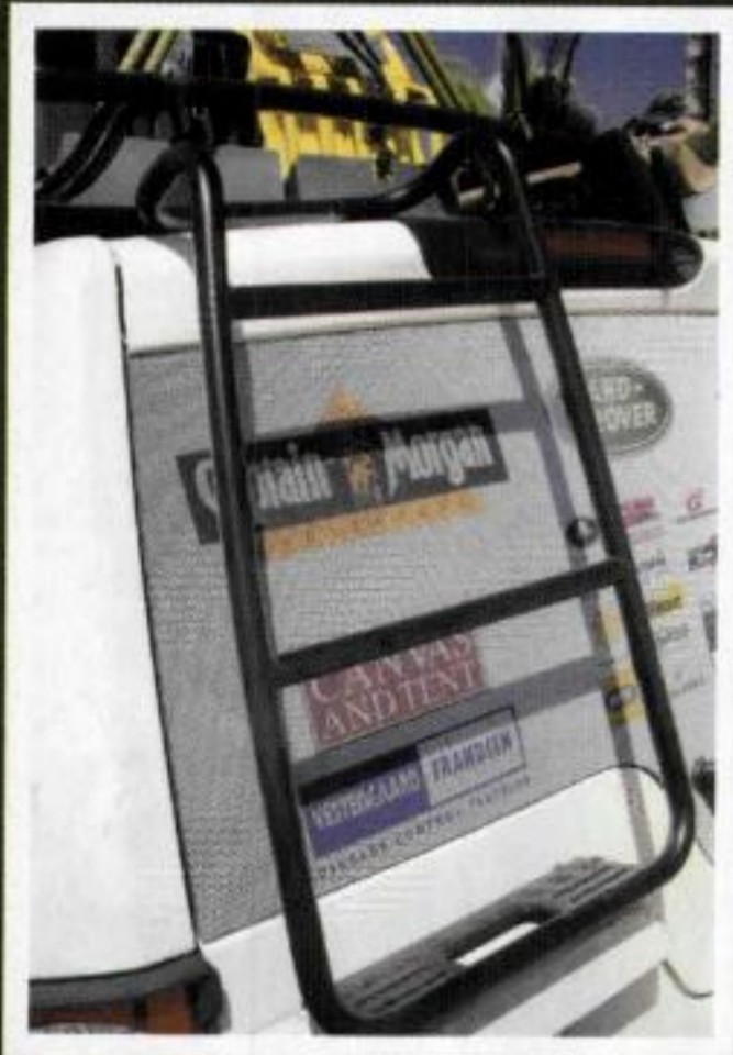
Expedition roof rack and ladder: The neat ladder provides access to the heavy-duty roof rack, which features additional reinforcement in order to cope with the abundant food, diesel, water and mosquito nets that are carried